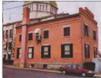
#47 Court St. Courthouse Annex Italianate Style, 1857.