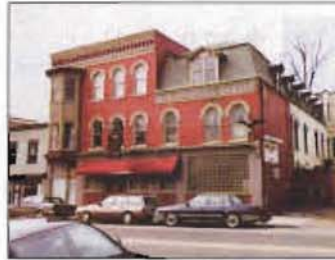
#48 520-522 Main St. Kaufman House Eclectic Style, 1879.